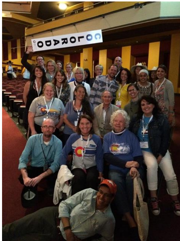
The Colorado Crew at the Main Street Now conference

Start an entrepreneurship mentoring program utilizing the successful entrepreneurs in your town, start a young entrepreneur program, have an Entrepreneur Hall of Fame to recognize successes.