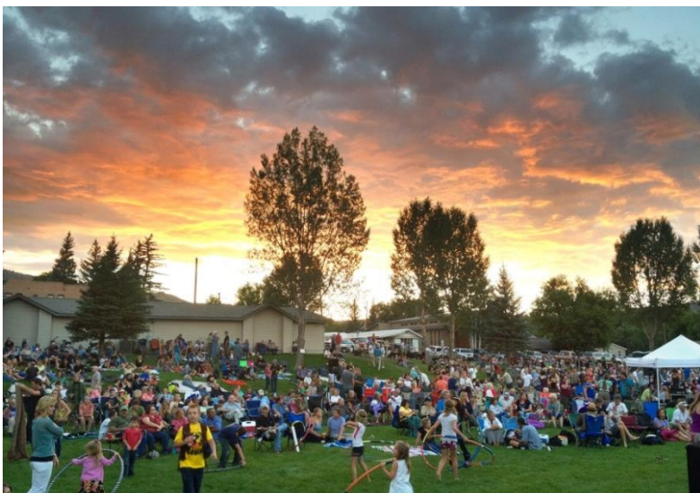
A stunning sunset provides the backdrop for the Ridgway Concert Series.

The Ridgway Concert Series is the epitome of a truly inclusive community event. It is an outstanding example of the kind of diverse 'happening' that can help a small town build excitement and generate economic vitality in its downtown. Make sure you visit next year for our 10th season!