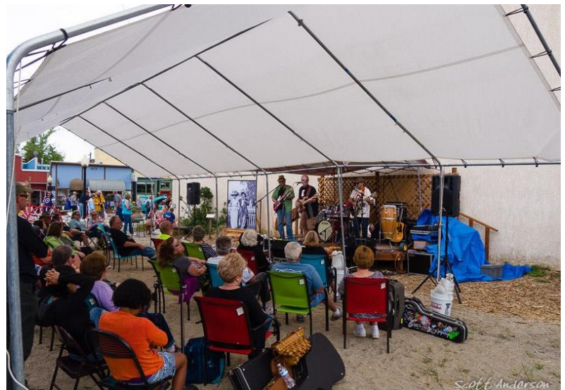
The audience enjoys musicians performing at the Buena Vista People's Stage.